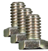
Hex Bolt 5/16-18x1/2